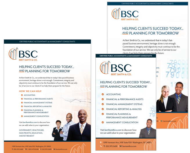
» print ads

Value in numbers. They say numbers don't lie. That may be true, but numbers have different meaning to different people. The result: they can tell very different stories. Bert Smith & Co. specializes in finding the meaning that matters most. They're more than an accounting firm to their clients. They're a strategic financial consulting partner, so they needed their brand to reflect that. We designed a new website that spoke to its primary audiences, developed marketing collateral, and created advertisements to complement their new online presence.